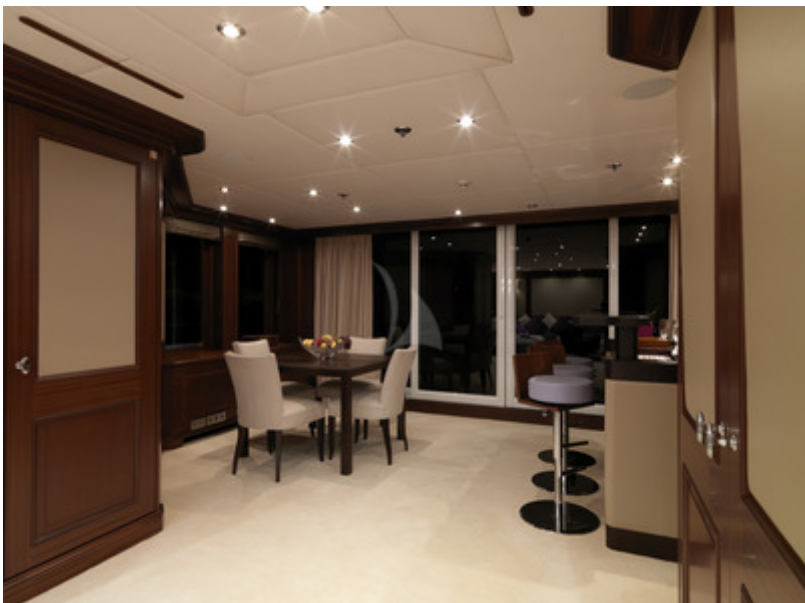
Upper Salon 3