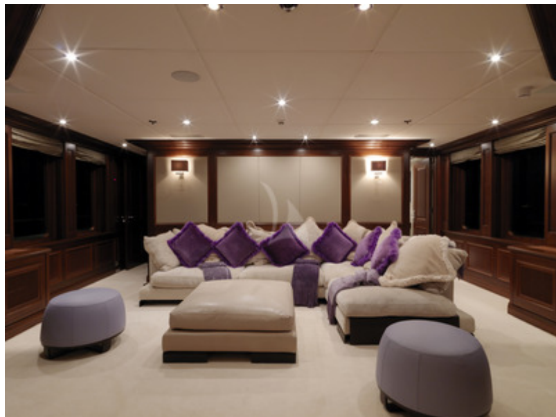
Upper Salon 2