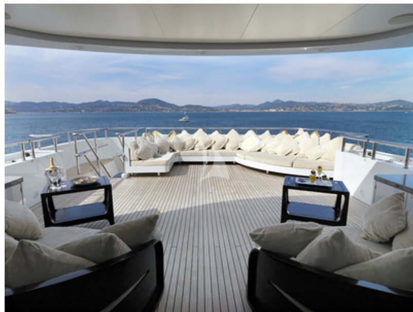
Sun Deck 2