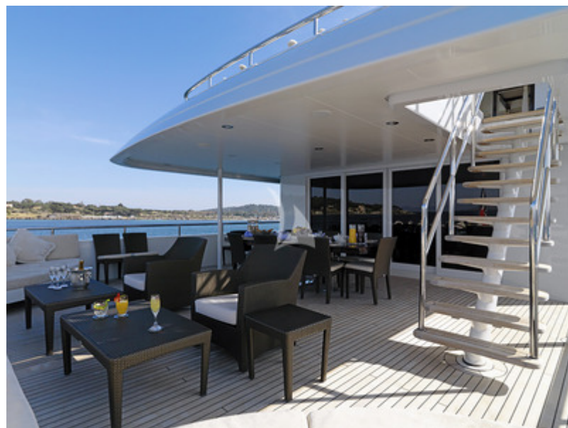
Bridge Aft Deck 2