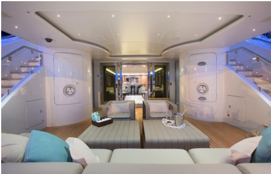
Main Aft Deck Lounge