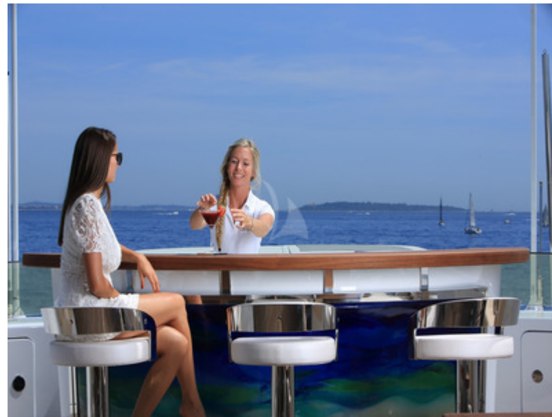
Sun Deck Bar