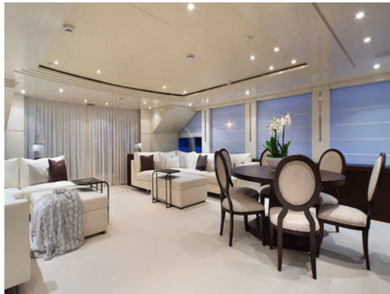
Upper Deck Salon