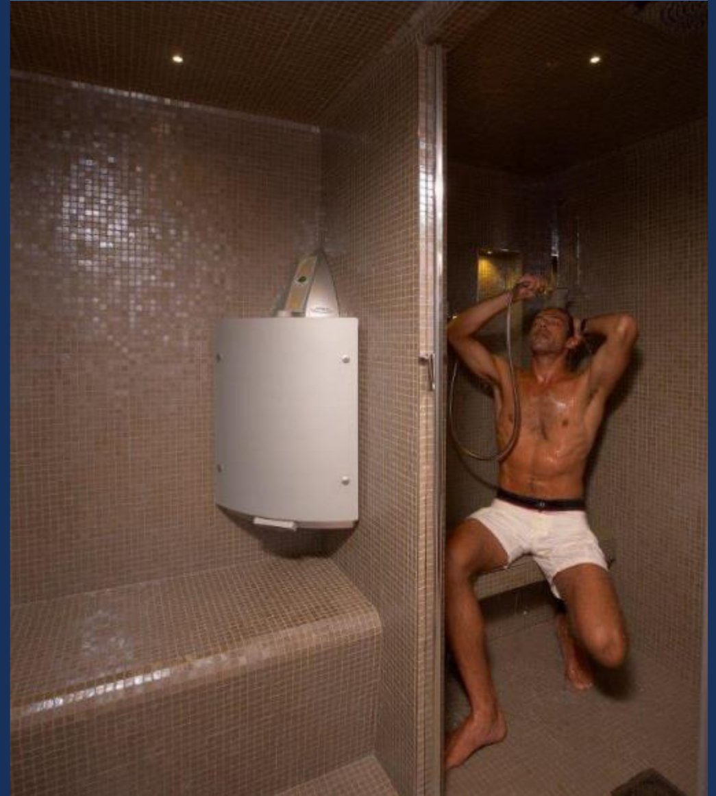
Sauna / Steam Room